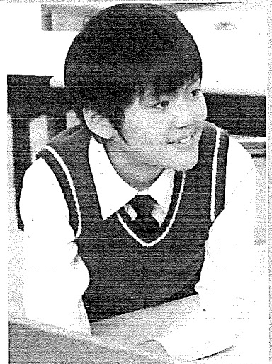
A Chinese student studying English.

Asia has the largest percentage of the world's population, followed by Africa and Europe. Comparatively, North America—meaning Mexico, Canada, and the United States—has a smaller population. Despite this, many countries outside of the United States require their children to learn another language, frequently English.